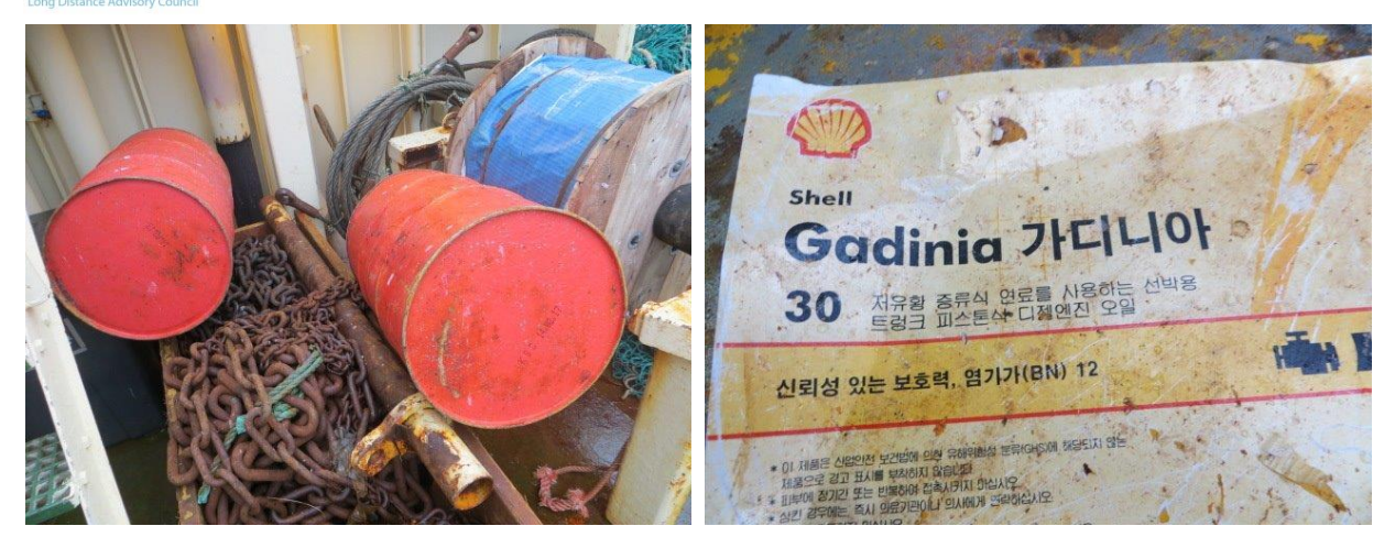
Photo 5 & 6: Oil barrels "caught" by f/t "Reval Viking" in NEAFC area Ia March 27 2015.

Recommendations from ELDFA (Estonia) concerning static gear in NEAFC