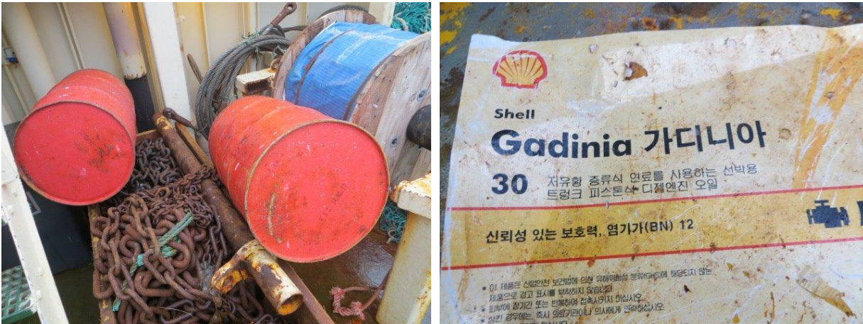
Photo 5 & 6: Oil barrels “caught” by f/t “Reval Viking” in NEAFC area Ia March 27 2015.